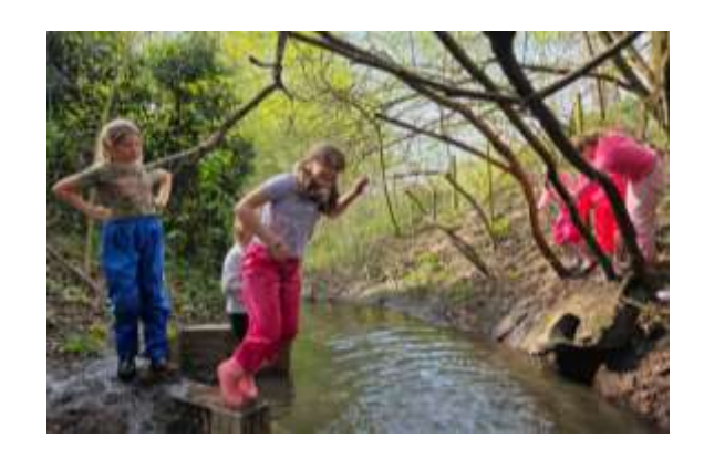
Is that a bird?